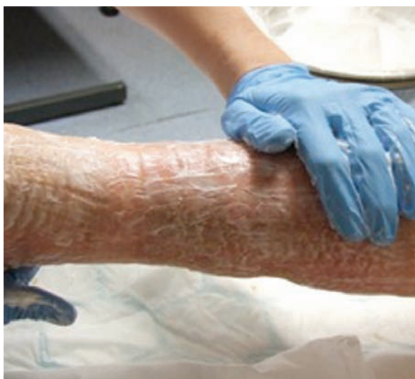
Figure 2: Application of a moisturiser using a downward movement.

It is important to advise the patient/ carer not to stop treatment once the condition is controlled as emollient therapy will help to prevent future exacerbations (Patel and Yosipovitch, 2010).