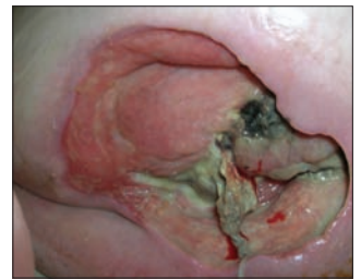
Figure 4: Pressure ulcer located on the sacrum, presenting with exposed bone, slough and granulation tissue

Staff and carers involved in looking after individuals at risk, or with existing pressure ulcers should use national guidelines on the prevention and treatment/management of pressure ulcers to ensure that best practice is provided. In addition, they should follow local protocols. This includes protection of vulnerable adults — that is, anyone aged 18 or over who is in need of community care services and is unable to look after themselves (DH, 2000).